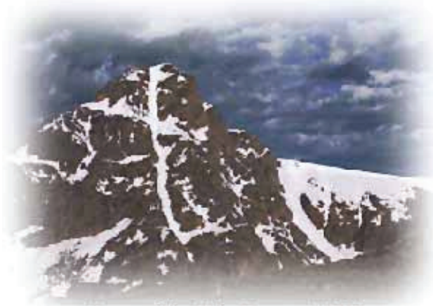
Mount of the Holy Cross - 14,005'

A mountain is an awesome place to "seek God's face" for our crumbling nation!