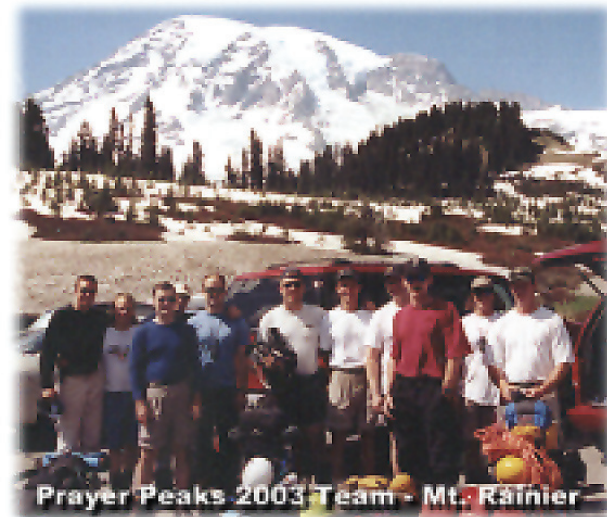
Prayer Peaks 2003 Team - Mt. Rainier

You, family and friends climb a Fourteener and pray for the Christian Church in the state of your choice (chosen on a first-come, first-served basis). A prayer guide is listed on our web site.